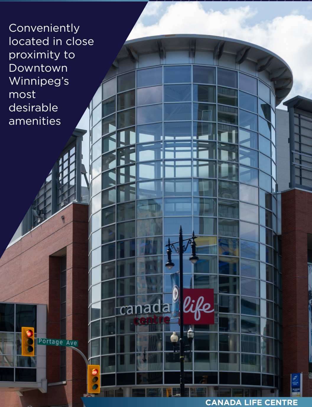
CANADA LIFE CENTRE

Conveniently located in close proximity to Downtown Winnipeg's most desirable amenities