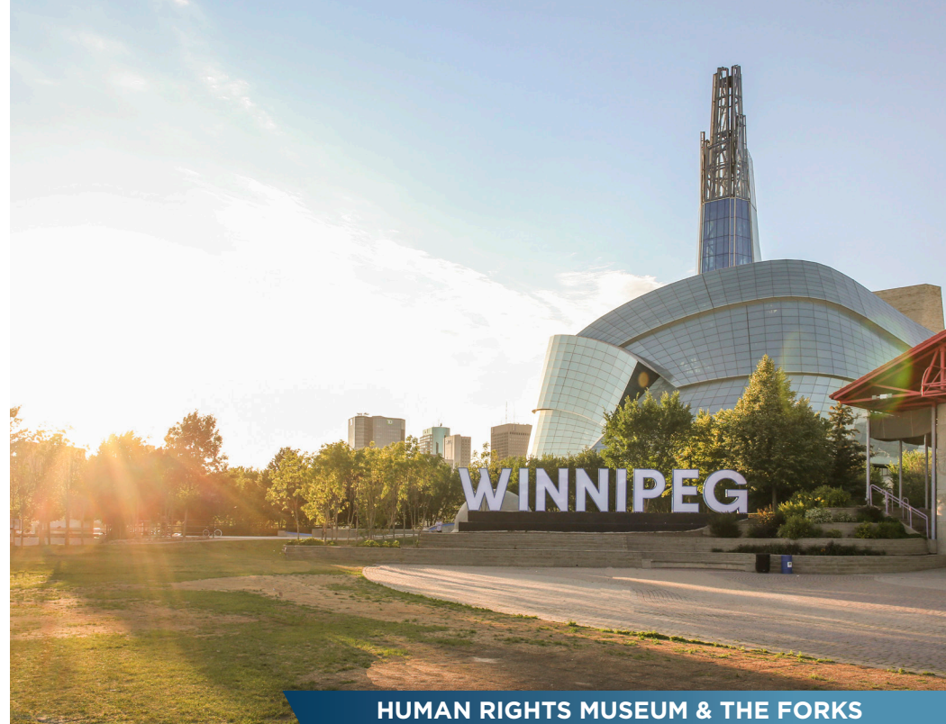
HUMAN RIGHTS MUSEUM & THE FORKS