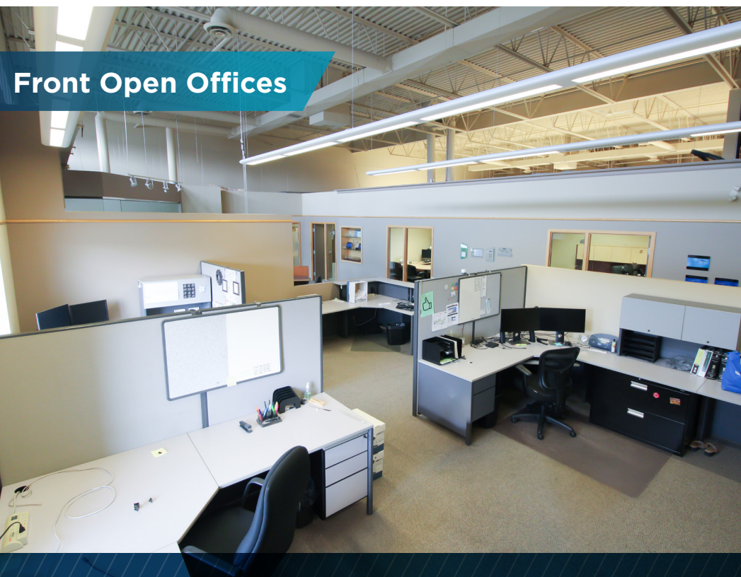
Front Open Offices