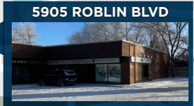
5905 ROBLIN BLVD