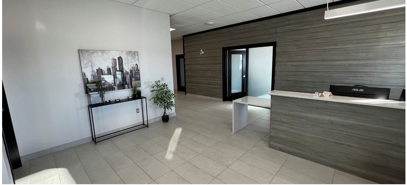
Independently Owned and Operated / A Member of the Cushman & Wakefield Alliance ©2023 Cushman & Wakefield. All rights reserved. The information contained in this communication is strictly confidential. This information has been obtained from sources believed to be reliable but has not been verified. NO WARRANTY OR REPRESENTATION, EXPRESS OR IMPLIED, IS MADE AS TO THE CONDITION OF THE PROPERTY (OR PROPERTIES) REFERENCED HEREIN OR AS TO THE ACCURACY OR COMPLETENESS OF THE INFORMATION CONTAINED HEREIN, AND SAME IS SUBMITTED SUBJECT TO ERRORS, OMISSIONS, CHANGE OF PRICE, RENTAL OR OTHER CONDITIONS, WITHOUT NOTICE, AND TO ANY SPECIAL LISTING CONDITIONS IMPOSED BY THE PROPERTY OWNER(S). ANY